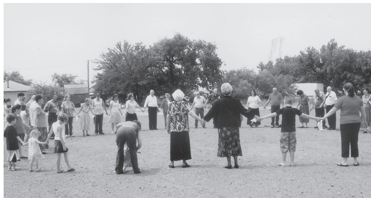
The Cox City Baptist Church had a ground breaking ceremony June 28 at their new building site, where the Cox City School was formerly located. The members gathered for a circle of prayer to ask the Lord's blessings as the church prepares to build their new church building to better serve the Cox City Community.